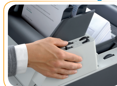
Easy to load feeders