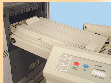
Enclosed paper path provides optimal document security