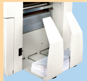
Standard Catch Tray