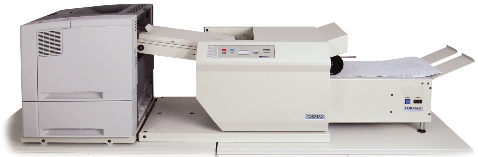
FD 2000IL System shown with IL Pressure Sealer and IL Alignment Base, laser printer (not included), optional conveyor and optional locking cabinets