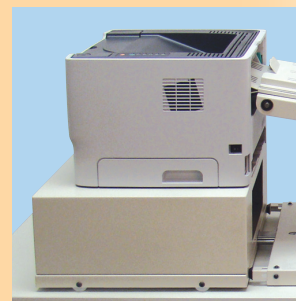
FD 2000-45IL Riser with HP/Troy P2015 Printer

** Dimensions include IL Pressure Sealer and IL Alignment Base (both included) and laser printer (not included in system)