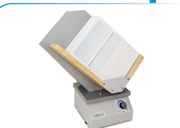
402 Series Jogger - an option which reduces static electricity from forms and aligns them for proper feeding

Formax - New Hampshire, USA www.formax.com