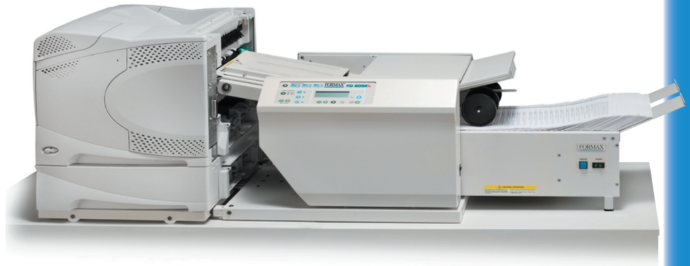
FD 2052IL System shown with IL Pressure Sealer and IL Alignment Base, laser printer (not included), optional conveyor and optional locking cabinets