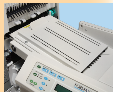
Enclosed paper path provides optimal document security